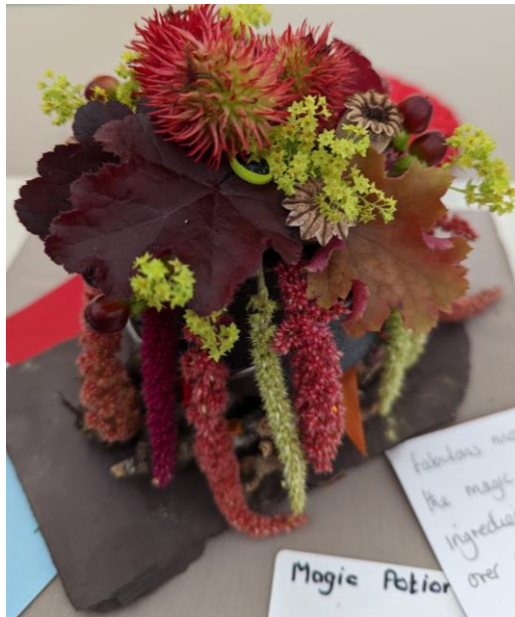
1 st Place 'Magic Potion' Carol Baker