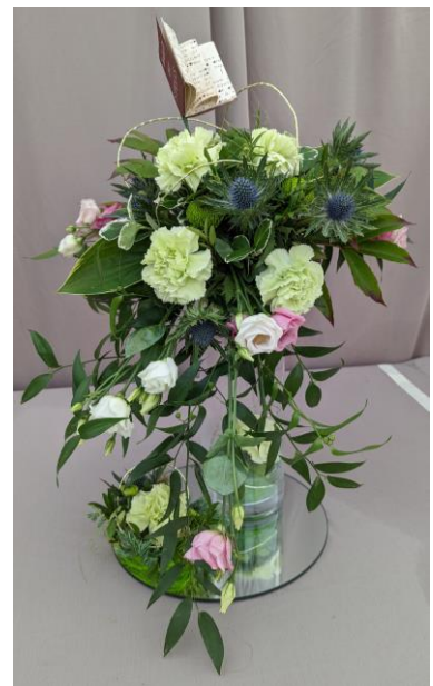
3 rd Place 'Spellbound' Judy Gratton